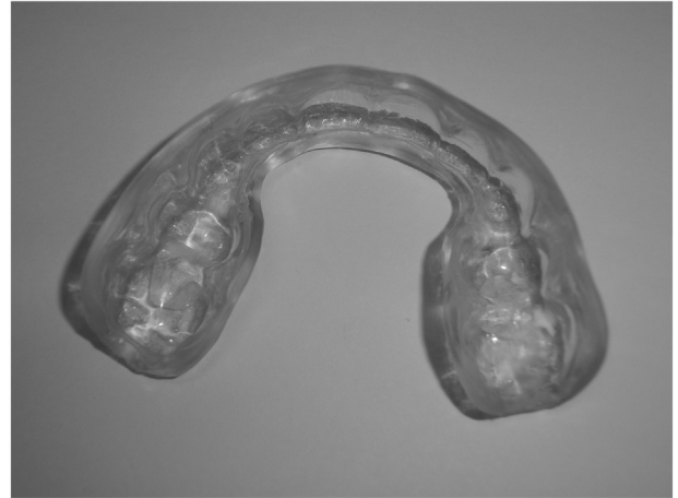
Fig. 1. Mouthguard used in this study.

Participants performed a specific warm-up with a free load bench press and a leg press machine (Technogym, S.p.A. Inc., Gambettola, Italy). Researchers asked the subjects to perform two maximal power repetitions with 30, 40, 50 and 60 kg in the bench press (BP30, BP40, BP50 and BP60 respectively) and with 190, 220, 235 and 250 kg in the leg press (LP190, LP220, LP235 and LP250 respectively). The loads described were usually used in team's strength training sessions during the in-season period and could be lifted by all the subjects being all below 80% individual 1RM, and could be lifted at least six times per set at the moment of the tests.