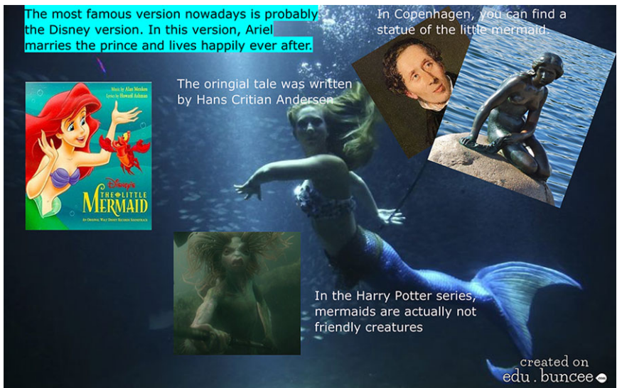
FIGURE 3. Example using Buncee.

The next step of the project involved students working in groups to choose a traditional Catalan legend and translate it into English, identifying the aspects deemed problematic to translate like idiomatic expressions or cultural references. From their translation, they developed a 2-minute script in English and created a storytelling video. Subtitles were added in English and the script was back-translated to provide subtitles in Catalan and Spanish (Figure 4). Last, students created a listening comprehension quiz to accompany their video and both were published on the blog.